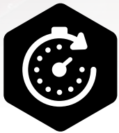
FREQUENCY OF SUPPORT