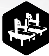
NUMBER OF MACHINES